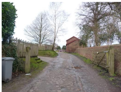
Surviving cobbles along the entrance to Dog Farm