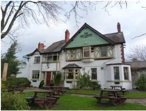
Axe & Cleaver PH