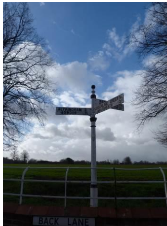
A traditional direction sign