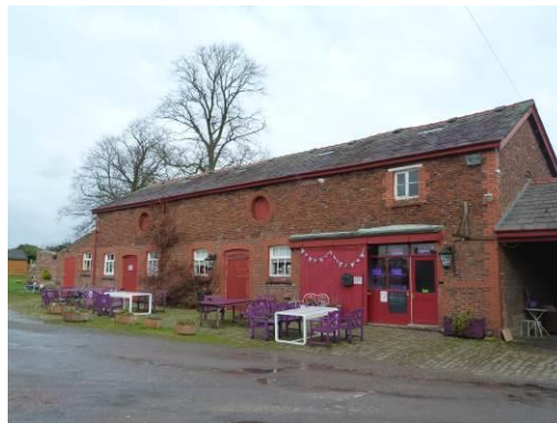
The Lavender Barn at Dog Farm, where the cheaper mottled bricks are supplemented with the higher quality smooth bricks.