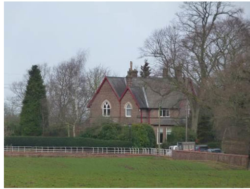
Bishop's Lodge, which has elements of a Gothic Revival Arts & Crafts style

2.2.5 The agricultural buildings are predominantly brick-built with traditional features such as side-hung doors and haylofts. These historic buildings should be retained rather than replaced with modern steel-framed alternatives. Being of brick construction, the size of the agricultural buildings is typically smaller than modern equivalents, which would detract from the established built scale. The windows are frequently Georgian in style (i.e. small panes) but with a characteristic bottom-hung top row which opens inwards.