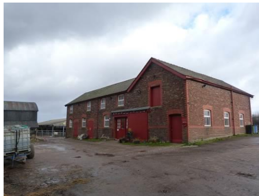
Little Heath Farm yard, where a farm shop has been established in the brick yard building. Note the hayloft, traditional side-hung doors and modest scale.

2.2.5 The agricultural buildings are predominantly brick-built with traditional features such as side-hung doors and haylofts. These historic buildings should be retained rather than replaced with modern steel-framed alternatives. Being of brick construction, the size of the agricultural buildings is typically smaller than modern equivalents, which would detract from the established built scale. The windows are frequently Georgian in style (i.e. small panes) but with a characteristic bottom-hung top row which opens inwards.