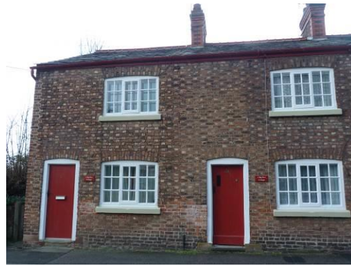
Georgian-style side-hung windows, 3 & 4 Big Tree Cottage

2.2.3 Chimneystacks are also quite prominent, different widths and heights indicating where they have historically been rebuilt or added later. A very small number of both open and closed porches are extant. These would not be an appropriate feature to introduce on the terraced cottages fronting directly onto the pavement.