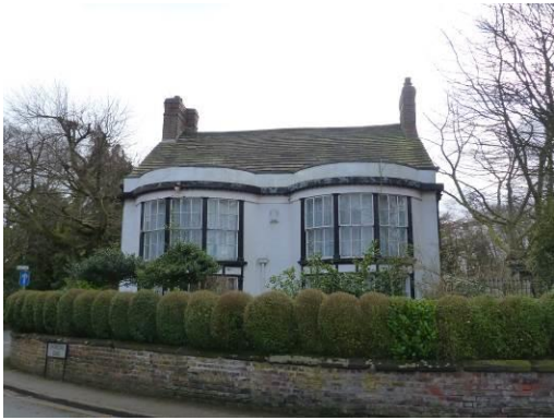
Big Tree House, with its distinctive bay windows