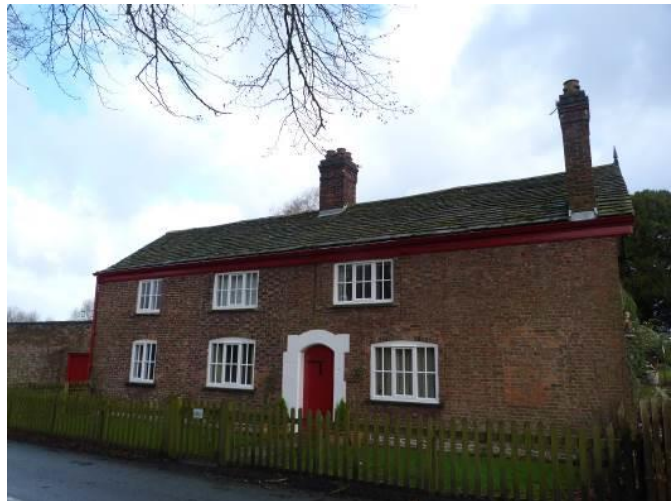
101 Woodhouse Lane, with different chimneystacks

2.2.4 The larger residential buildings within the Conservation Area are slightly more ornate, with features individual to each. These include the large bay windows on Big Tree House, large gables on The Rowans and Bishop's Lodge, and other modest classical features such as pediments. There is evidence of an Arts & Crafts influence on some buildings, for example the decorative ridge tiles and mock-Tudor timbering on Laurel Bank and Spinney Bank. The larger residences frequently have Georgian-style sash windows, denoting their historically elevated status.