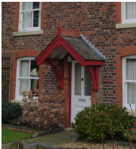
The open porch at Grosvenor Cottage

2.2.3 Chimneystacks are also quite prominent, different widths and heights indicating where they have historically been rebuilt or added later. A very small number of both open and closed porches are extant. These would not be an appropriate feature to introduce on the terraced cottages fronting directly onto the pavement.