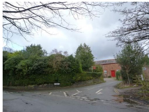
Low-level masonry wall with supplementary planting