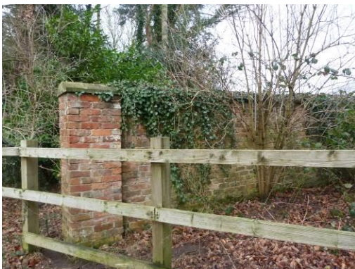
A detached section of the original park wall, which is in need of attention

2.4.4 Within the extension area at the south end of the Conservation Area, a section of historic park wall has been cut off by the road and stands in amongst overgrown vegetation. This is a historically important feature and appropriate, traditional repairs will need to be carried out to protect against collapse.