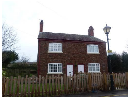
Timber fencing in front of West View and Sunset View

2.4.2 Further north within the Conservation Area, a low-level boundary wall of roughly-hewn local masonry is more commonplace (and is also evident at other locations within the Conservation Area). This continues the traditional boundary treatment in the wider area and is best supplemented with additional planting, which needs to be strategically positioned and maintained to minimise root damage to the wall. Modern timber panelling above these walls is not appropriate as it has a temporary, ad hoc appearance. Pointing in these walls should be minimal; thick ribbon pointing or similar detracts from the character of the local stone and can cause damage if a cementitious mix is used. Matching historic gateposts, such as those at The Rowans, should also be kept.