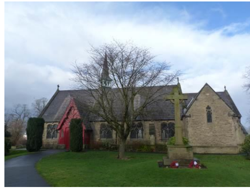
St Mark's Church. Both the pub and church have timber detailing in an Arts & Crafts style.