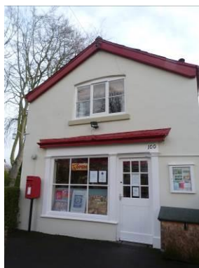
School Lane shop