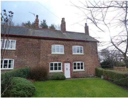
Farm Cottage, where the balance of the original elevation has been altered with the removal of a door at the far end